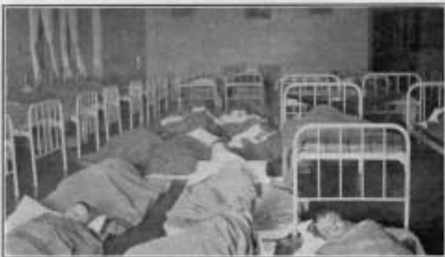
THIS DORMITORY IS INDECENTLY CROWDED. BUT THERE ARE 400 APPLICANTS FOR ADMISSION TO ROME THAT CANNOT BE ACCOMMODATED.

Photo “Of the Conditions... in Institution for the Feeble-minded at Rome”, from SCAA News, May, 1914, Vol. II, No. 4.